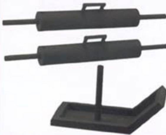
Mastiff Farmer's Walk Implements & Sled