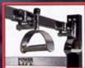
Optional Rotating Chin Up Handles (Patent Pending)