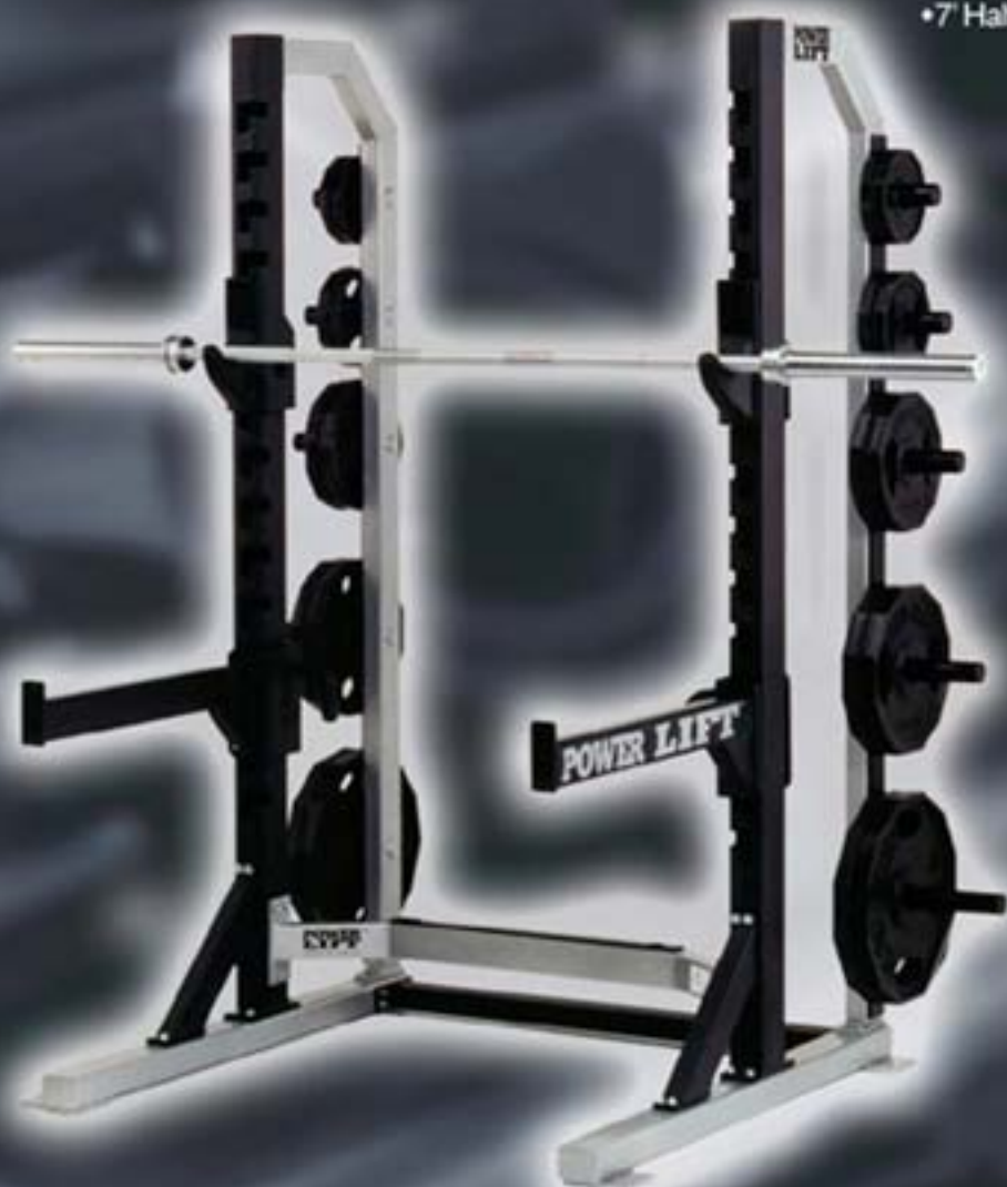
•7' Half Rack