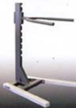
Adjustable Dip Stand