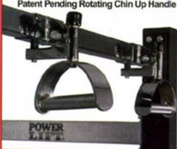
Patent Pending Rotating Chin Up Handle