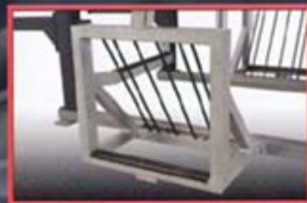
Adjustable Bumper Plate Storage