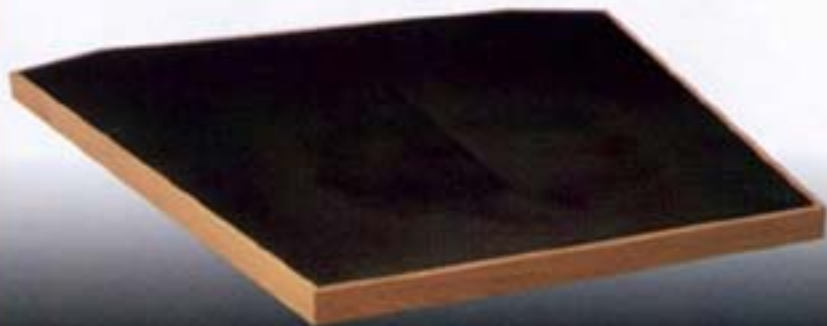
Jammer Platform with Rubber Top