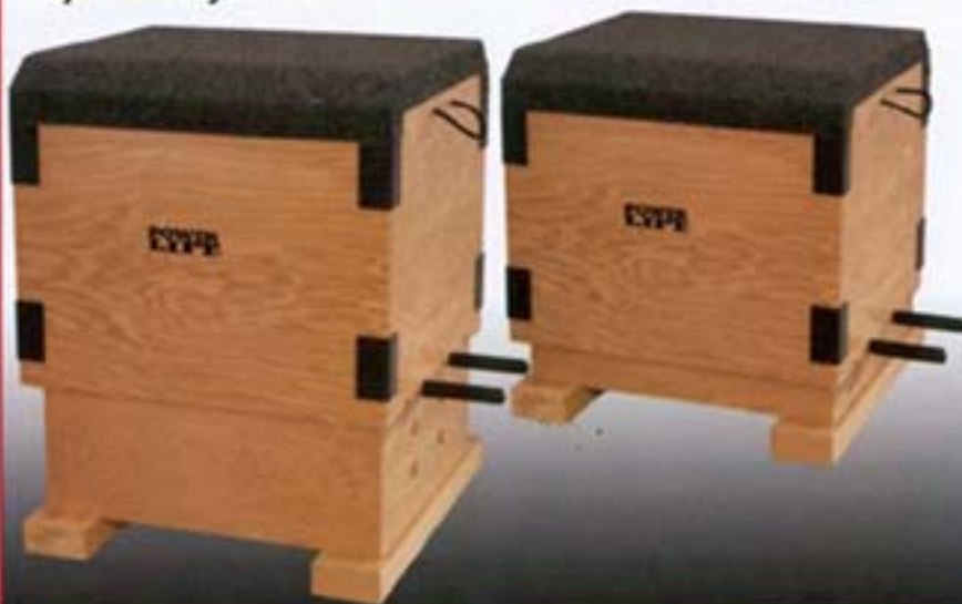
Adjustable Plyo Boxes