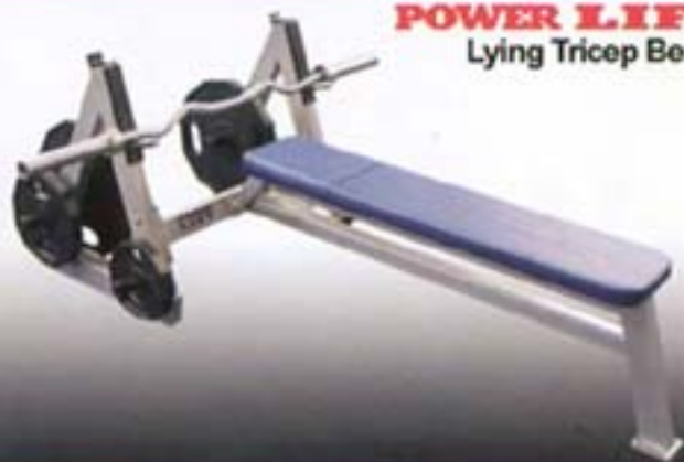
POWER LIFT Lying Tricep Bench