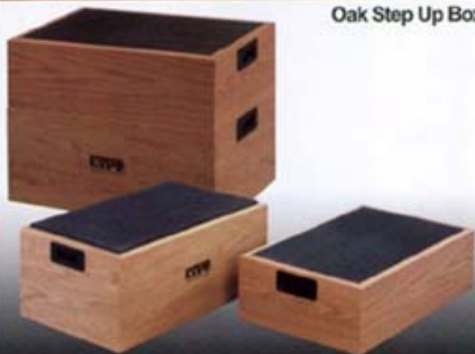
Oak Step Up Boxes