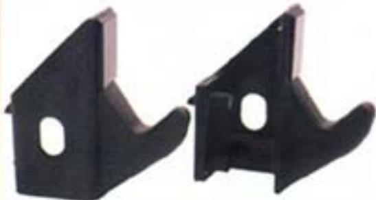
Patented "Rhino Hook" Bar Catches