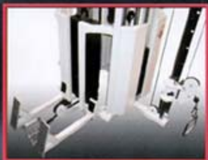
Fold Up Foot Support