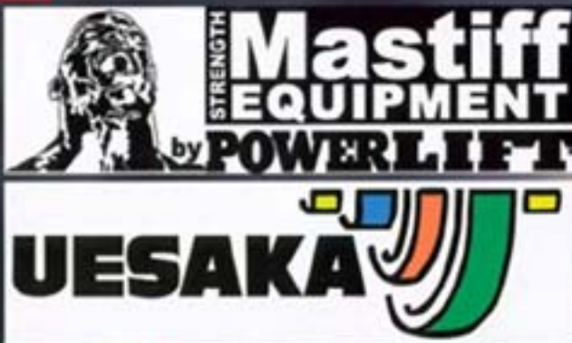
Uesaka Kilo Bumper Plates

Available in 45 lb., 35 lb., and 25 lb. Plates