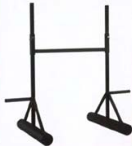
Mastiff Super Yoke