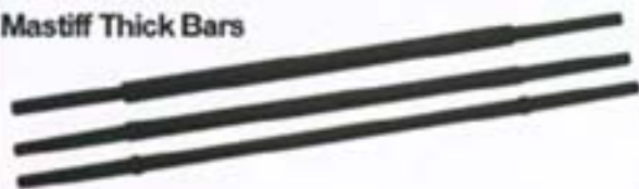
Mastiff Thick Bars