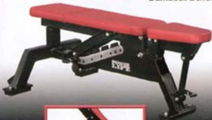
POWER LIFT Dumbbell Bench