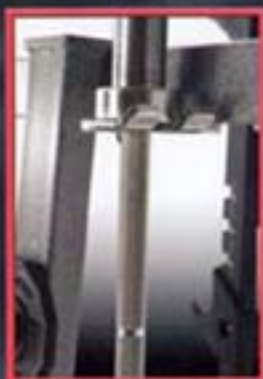
Olympic Bar Storage