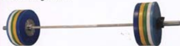
Uesaka Kilogram Set